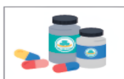
Health functional food